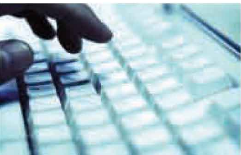
Easy interface and delivery